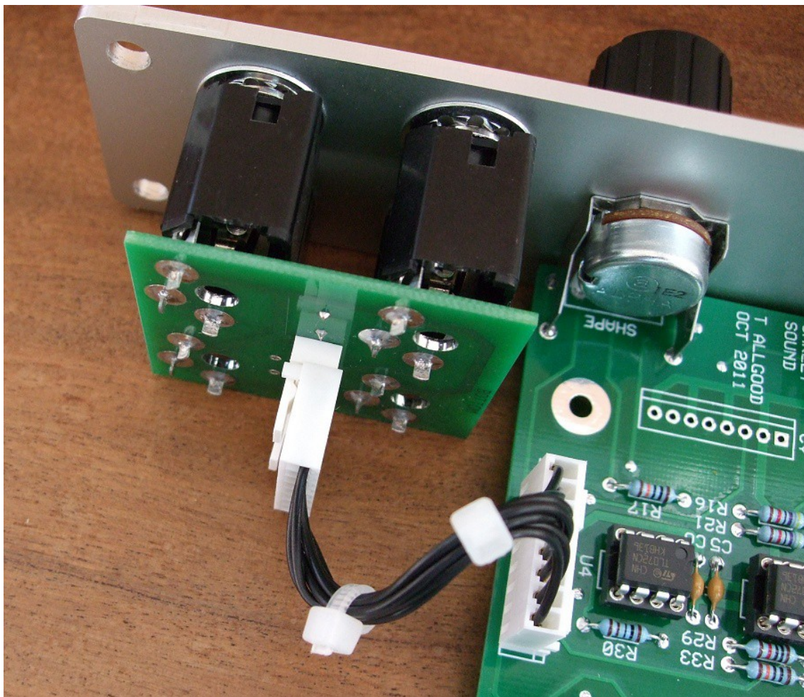
The prototype TSL-3 filter core module showing the detail of the board to board interconnect. Here I have used the Molex KK 0.1" system to connect the Sock4 to the main PCB.

You need to make up only one eight way interconnect. It should be made so that it is 100mm long.