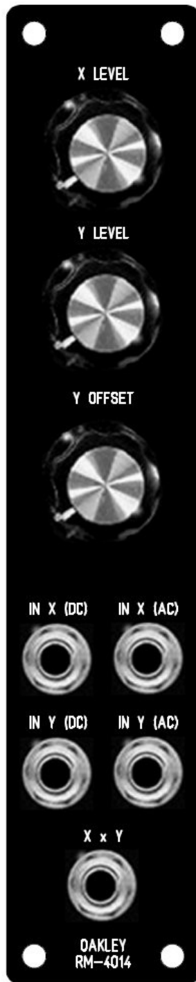
The suggested 5U panel design. Note the slightly different spacing of the knobs compared with the usual 41mm 5U Oakley standard.